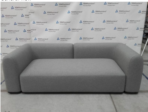
Fotografia / Photo 1 General view