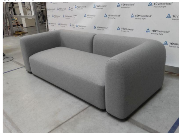
Fotografia / Photo 2 General view