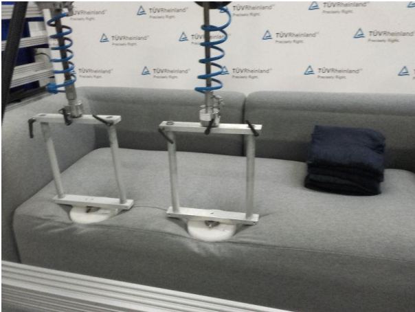
Fotografia / Photo 7 Construction details