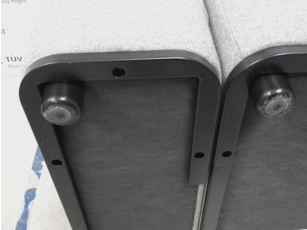
Fotografia / Photo 5 Construction details