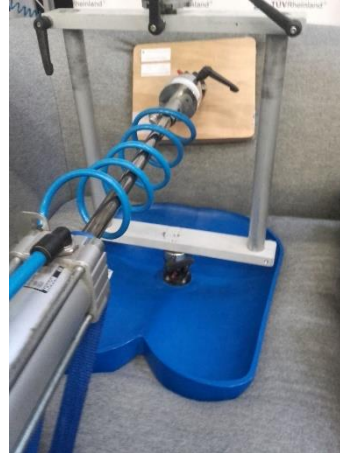
Fotografia / Photo 6 Construction details