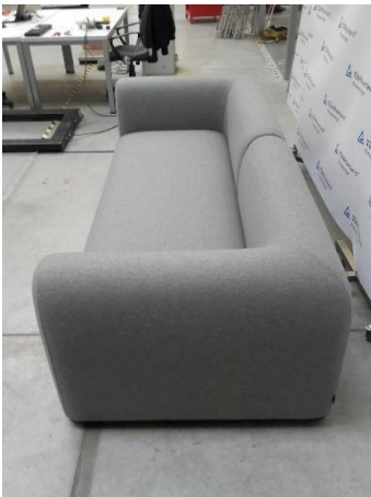
Fotografia / Photo 3 Construction details