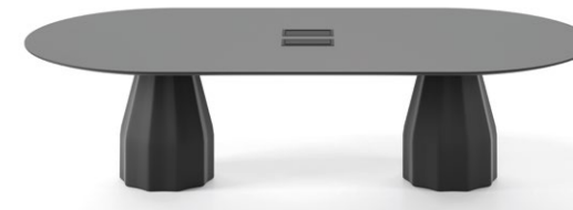
Burin double base H74 L240 cm / H29.13" L94.48" with powerbox