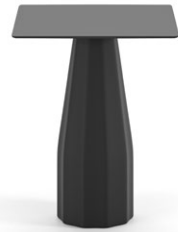
Burin H102 80x80 cm / H40.16" 31.50"x31.50"