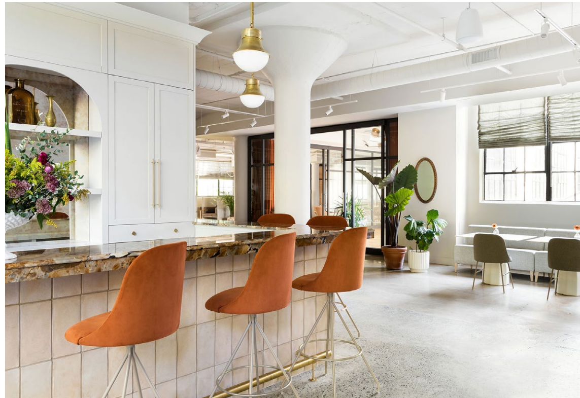
Project on the left page: HudCo Coworking Space, New York. Design: Christina Michelle Interiors.