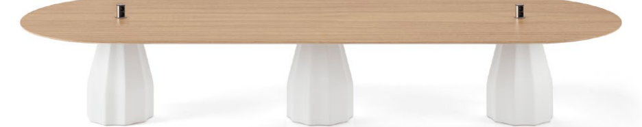
Burin triple base H74 L350 cm / H29.13" L889" with pop-up sockets