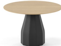
Burin H74 D120 cm / H29.13" D47.24"