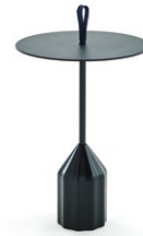
Burin Mini H50 + 10 cm (handle) / H19.69 + 3.94" (handle)