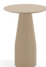
Burin H102 D80 cm / H40.16" D31.50"