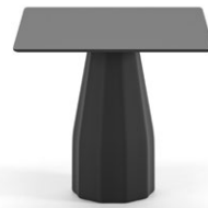
Burin H74 80x80 cm / H29.13" 31.50"x31.50"