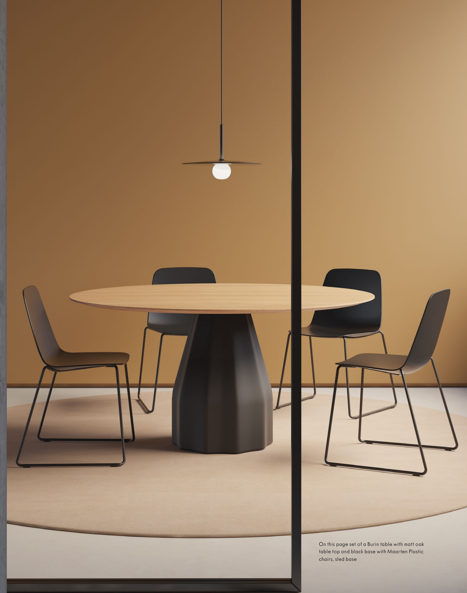
On this page set of a Burin table with matt oak table top and black base with Maarten Plastic chairs, sled base

With Patricia Urquiola, we learned to look for new ways of constructing, to make use of materials that the classic furniture industry would not have contemplated. We also learned to project a continuity within the collection. In Burin's case, it would happen at the time when we were expanding an existing family, but also with the use of rotational polyethylene in the manufacture of its base. The moment when we opened the doors to this material comes to mind: 2006 gave us the Last Minute stool and its seat in this same rotomolded polyethylene.