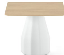
Burin H74 100x100 cm / H29.13" 39.37"x39.37"