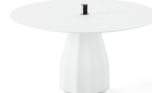
Burin central base H74 D150 cm / H29.13" D59.05" with pop-up sockets