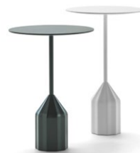
Burin Mini H50 - H55 cm / H19.69" - H21.95"