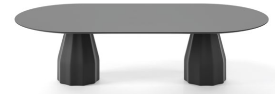
Burin double base H74 L240 cm / H29.13" L94.48"