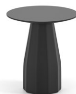
Burin H74 D70 cm / H29.13" D27.56"