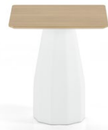
Burin H74 70x70 cm / H29.13" 27.56"x27.56"