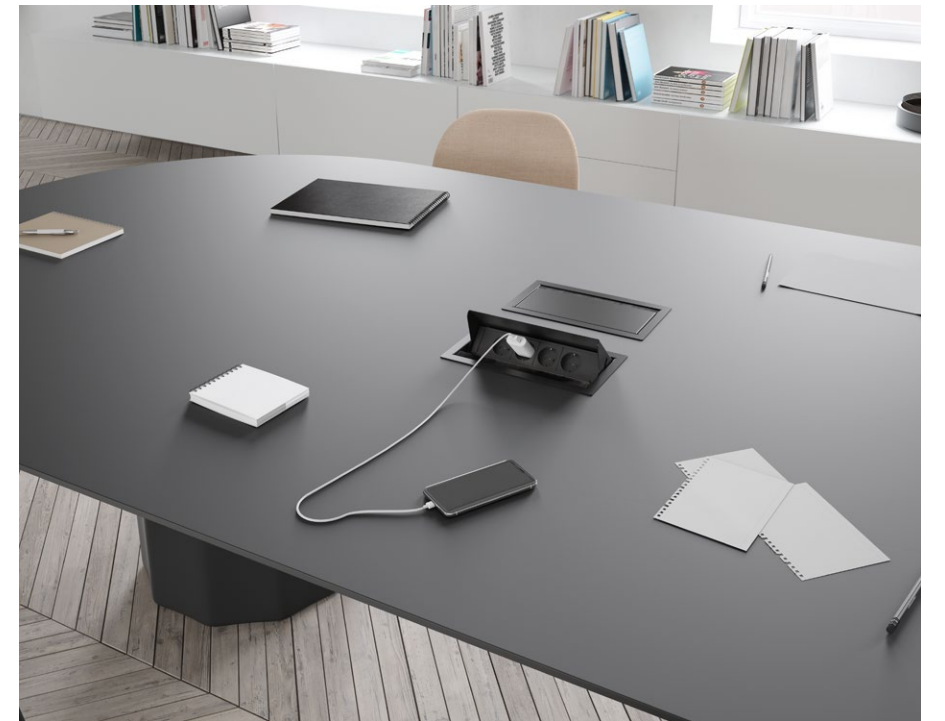
In these pages, a picture of Burin table with Aleta chairs