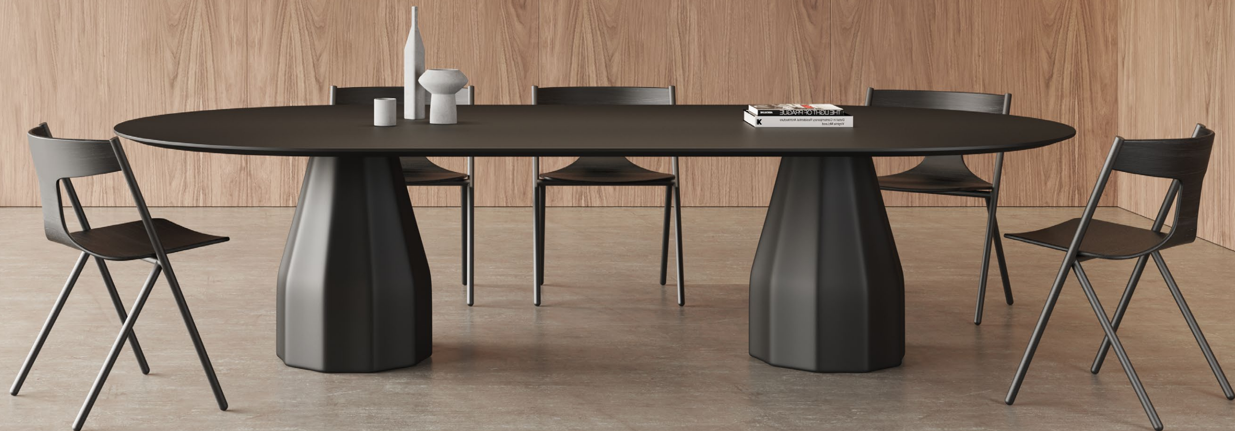
On this page, a set of a double Burin table lacquered in black with Quadra chairs in ash

It is fascinating how the use of an unusual component has managed to democratize this centrally based table. However, above all, it is interesting how it has happened without losing an ounce of character and differentiation. By giving the possibility of combining its base with more sophisticated boards, we manage to maintain the balance that is created between durability and elegance, no matter if it is in its single, double or triple base version.